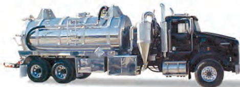
DOT Code Vacuum Units