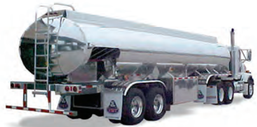
A30TRL (CUSTOM FLEET REFUELER)